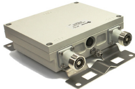
BK-75D Outdoor Model