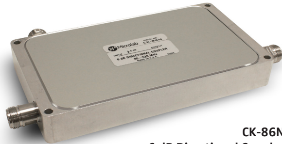
CK-86N 6 dB Directional Coupler

The CK-80 series, Directional Couplers, is a multi-section quarter wave, stripline design for indoor applications covering VHF, UHF, and Tetra bands, 80 to 520 MHz. Units couple off a defined fraction of signal with minimal reflections or loss.