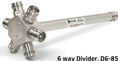
6 way Divider, D6-85FE