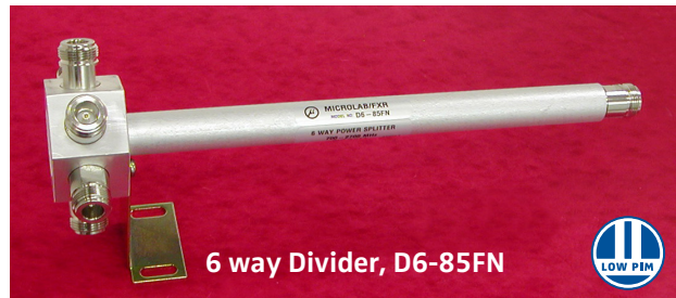
Six Way Outline