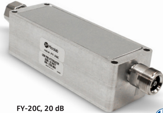
FY-20C, 20 dB Low PIM Attenuator